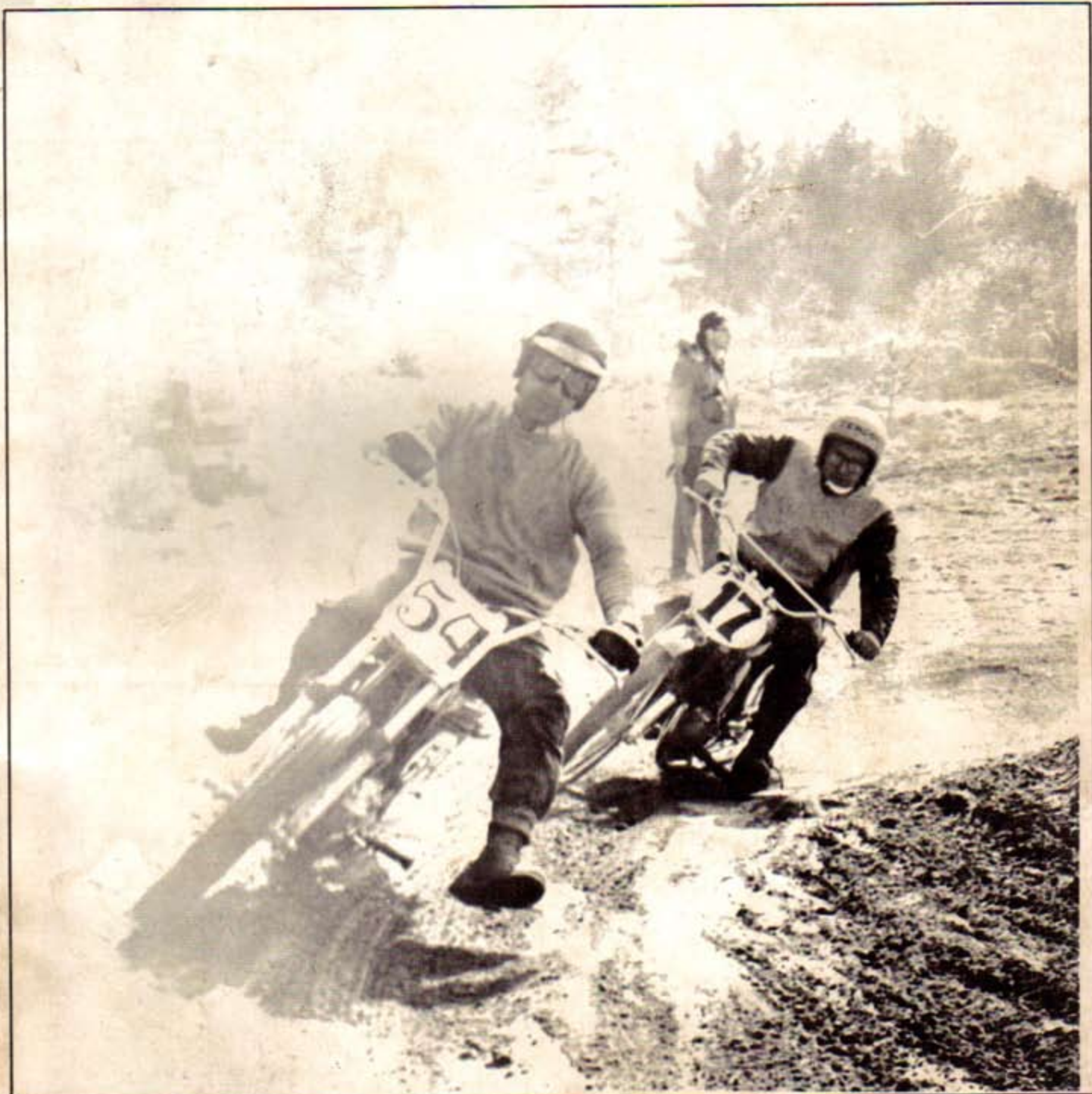
Old Scramblers Never Quit