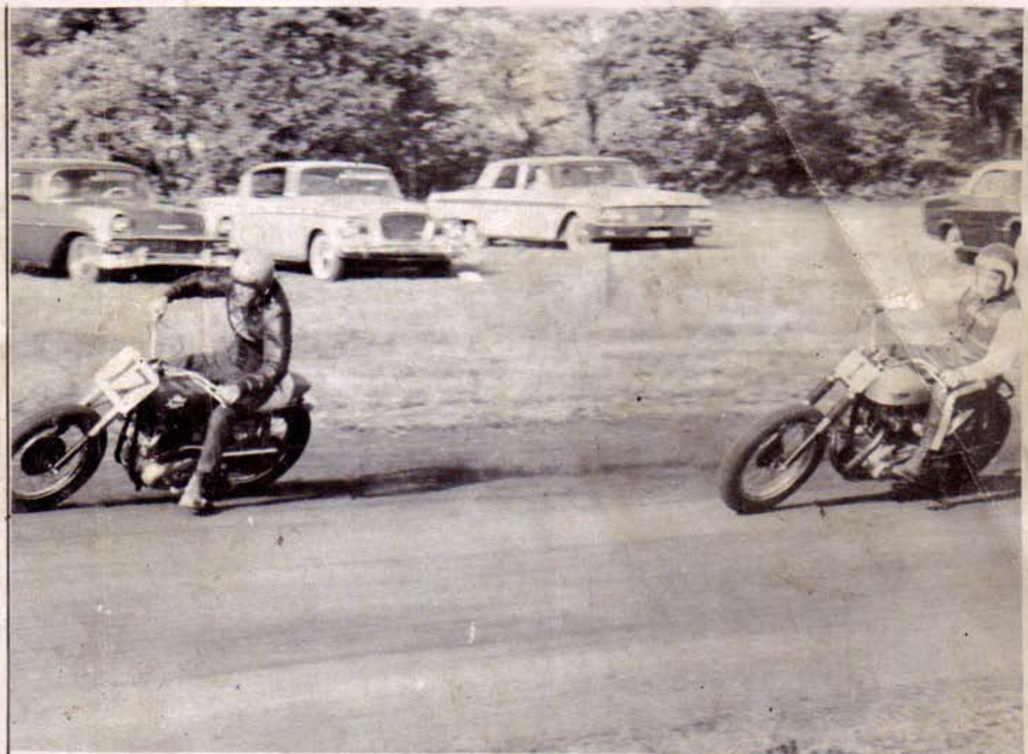
Those Pennsylvania Speedway Scrambles