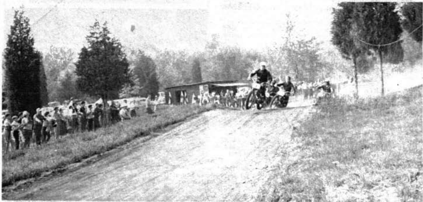
Don Roane leads the Class 2 Experts over the first jump.